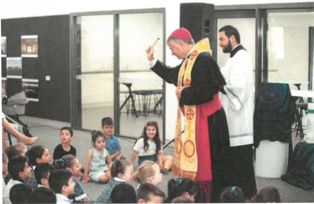
CELEBRATING THE OFFICIAL OPENING OF ST ANTHONY OF PADUA CATHOLIC COLLEGE