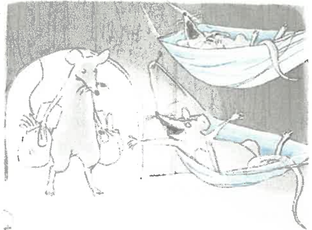
"FREE HAMMOCKS, all over town. It's like a miracle!"

So in retrospect, in 2015, not a single person got the answer right to "Where do you see yourself 5 years from now?"